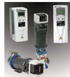
Goolds Aquavar User Interface

With the help of 'User Friendly Interfaces' variable-frequency drives allow more precise control of processes such as water distribution, aeration and chemical feed. Wastewater treatment plants can consistently maintain desired dissolved oxygen concentrations over a wide range of flow and biological loading conditions by using automated controls to link dissolved oxygen sensors to variable-frequency drives on the aeration blowers.